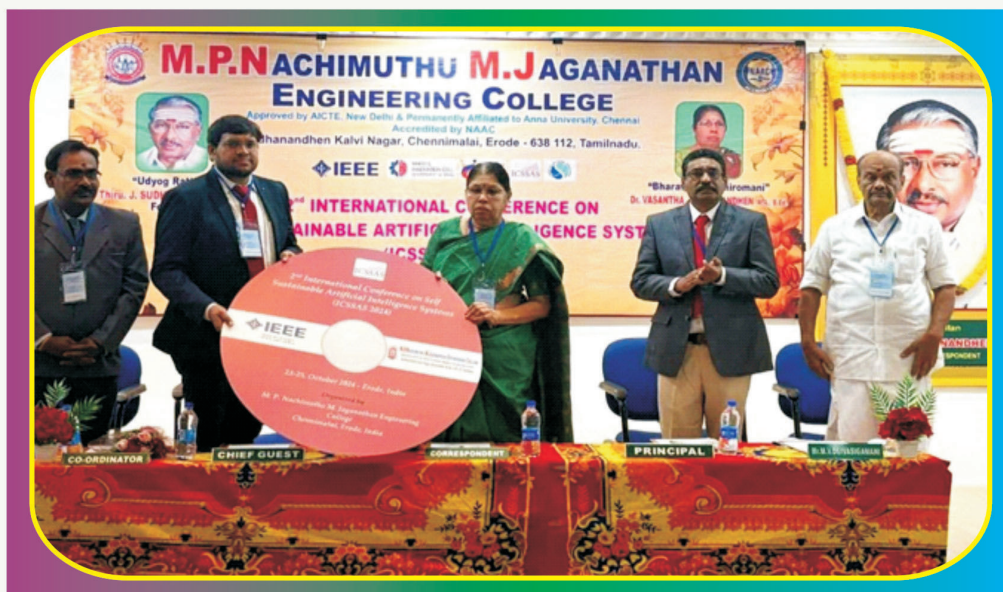
CD release in the International Conference