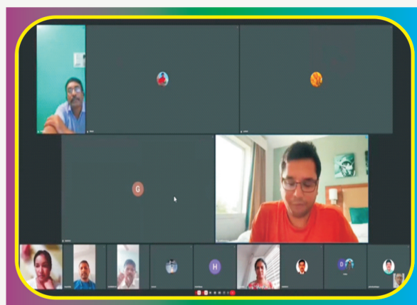
NRI Alumni Meet

Non-Resident Indian Alumni Meet has been conducted on 14 th July, 2024. Many of our students had attended this meet. They shared their experiences and expressed their happiness.