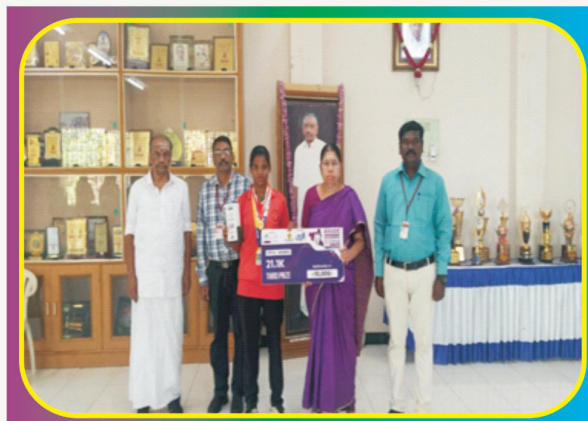
Correspondent's Appreciation for the Gold Medalist