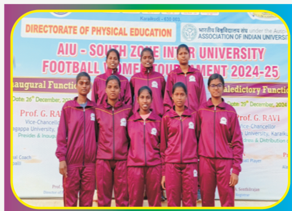
Anna University Women Football Team