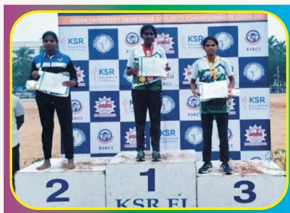
Anna University Inter-Zone Athletics meet held at KSR College of Technology, Tiruchengode on 30 th November & 1 st December, 2024. AU- Inter-Zone Athletics meet