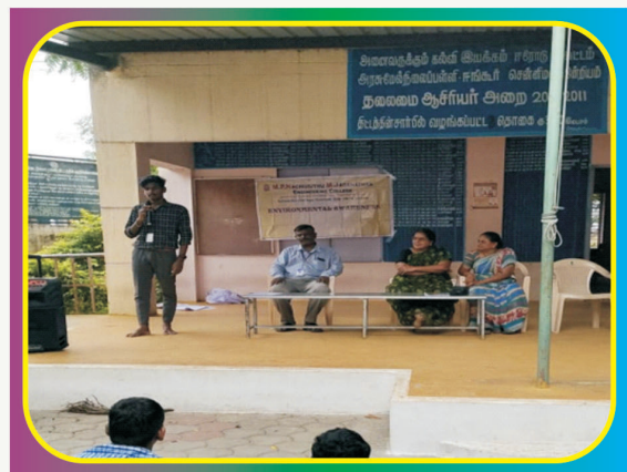
Environmental Awareness Programme

5 Students of final year CSE have attended a one day workshop on “ Flutter App Development ” at Kongu Engineering College on 9 th August, 2024.