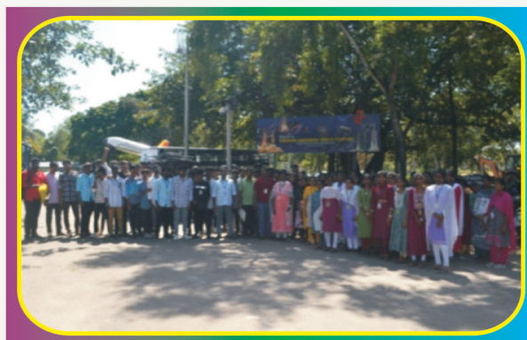
Industrial Visit to VSSC - ISRO at Trivandrum

II, III & IV year students of ECE went on an Industrial Visit to Vikram Sarabhai Space Centre - ISRO at Trivandrum on 13th September, 2024.