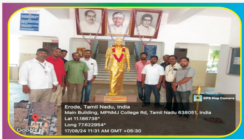
Alumni Meet - EEE

event. Alumni students contributed Rs.100000/- to Alumni Association of the college.