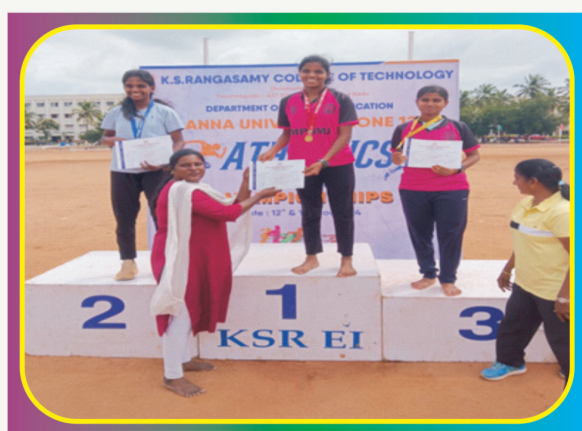
Anna University Zone-12 Inter-Collegiate Athletics Meet at KSR College of Technology