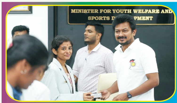
Memento received from Honourable Deputy CM, Udhayanithi Stalin, TN