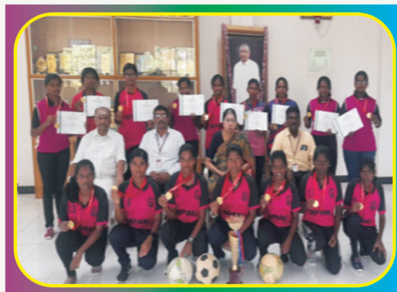
Winners of Anna University Inter-Zone Women Football Tournament