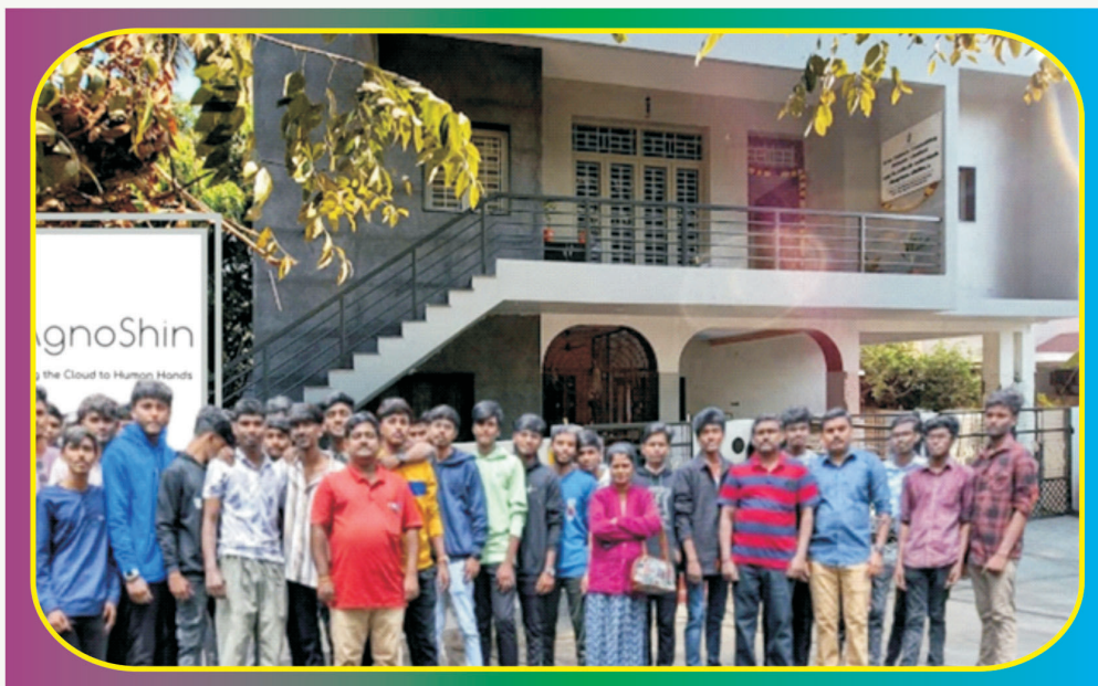
Industrial Visit to Agnoshin Technologies at Udumalpet

104 students went on an INDUSTRIAL VISIT to Agnoshin Technologies at Udumalpet, on 12 th September, 2024.