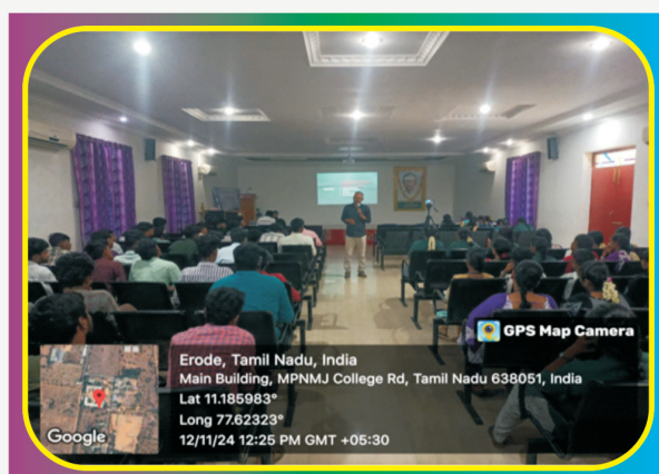
Workshop on “Drone Technology”