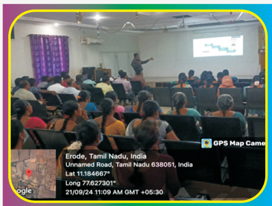
Workshop on “Outcome Based Education”

An MoU was signed with Sree Valarmathi Industries, Perundurai, on 19 th September 2024.