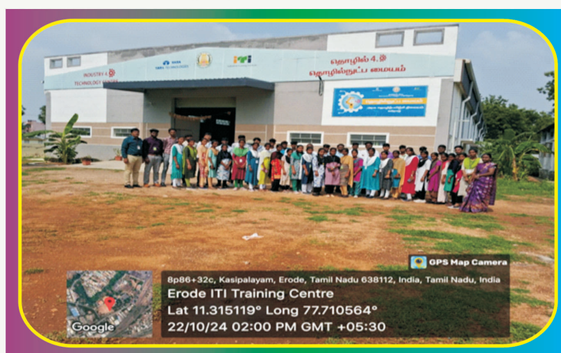
Industrial Training at ITI, Erode